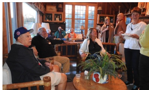
Hot Stove Party