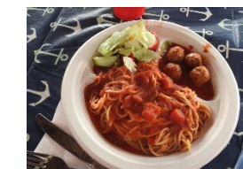
Commodore's Spaghetti Dinner